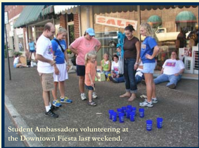
Student Ambassadors volunteering at the Downtown Fiesta last weekend.